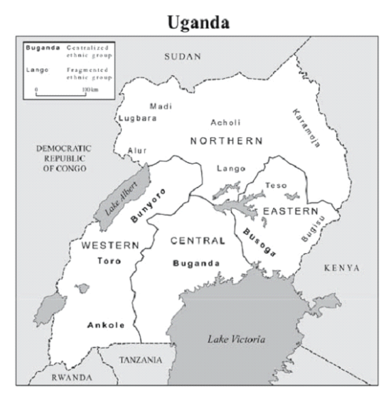
Map 1 Distribution of centralized and fragmented ethnic groups across Uganda regions