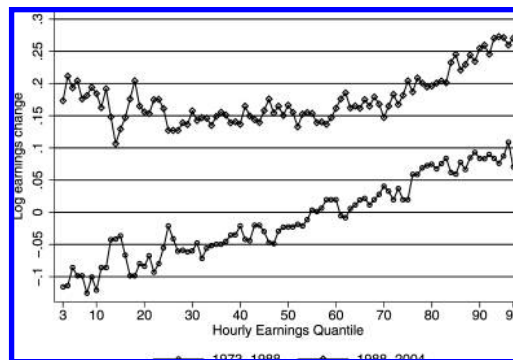
FIGURE 2. CHANGES IN MALE AND FEMALE LOG REAL HOURLY EARNINGS BY PERCENTILE, 1973–1988 AND 1988–2004

The divergence of upper- and lower-tail wage inequality since the late 1980s holds for residual wage inequality and is robust to adjustments for labor force composition changes (Autor et al.,